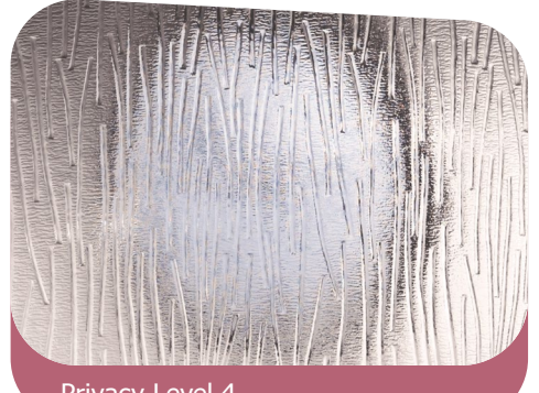
Privacy Level 4