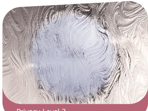
Privacy Level 3