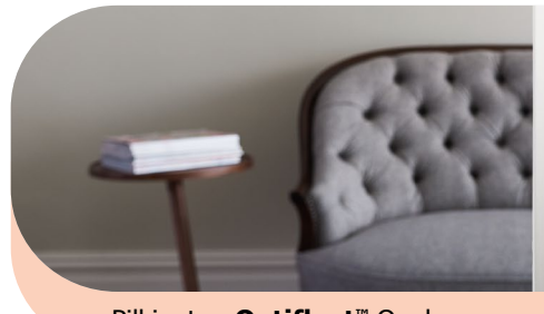
Pilkington Optifloat ™ Opal